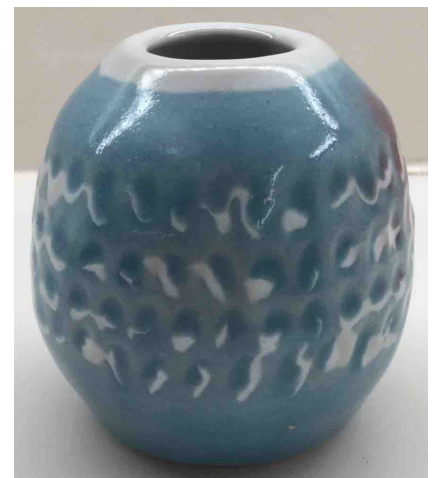
Vase, Blanche Rubin